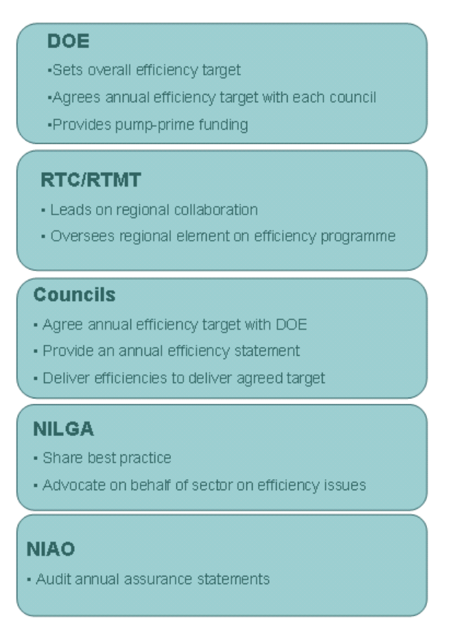
Figure 1: Efficiency Delivery Framework

In summary, the framework proposes that the key role for central government is to set efficiency targets and to provide pump-prime financing. Local government will take on responsibility for achieving the efficiency targets and